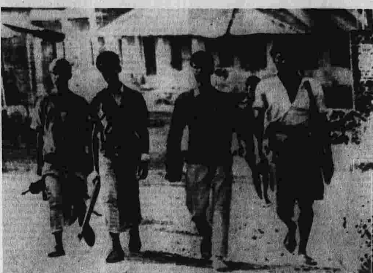
Bangla Desh guerrillas in full uniform patrol abandoned town near the Indian border.

According to Tass, Mars 2 first orbited the planet. A descent craft then separated from the mother ship and entered the planet's atmosphere by parachute. It landed in the southern hemisphere of Mars, in the region with the coordinates 45 degrees latitude south and 195 degrees longitude west. A parant with the cost of $1.5 billion, the Soviet Union, the hammer and sickle, was installed on the descent craft. The mother ship went into a wide orbit of Mars, circling the planet once every 11 days. Tass said, never coming closer than 800 miles to the planet's surface. Mars 2, launched by the Russians nine days earlier, went into a different wide orbit around the planet late last month. There was no announcement of any landing attempt by a descent craft from Mars 2. Tass said both Mars probes are carrying out a program of outer space near Mars from the Soviet news agency plane. It said without elaboration that the information received from Mars 2 was "of great interest to the Soviet Union and the United States."