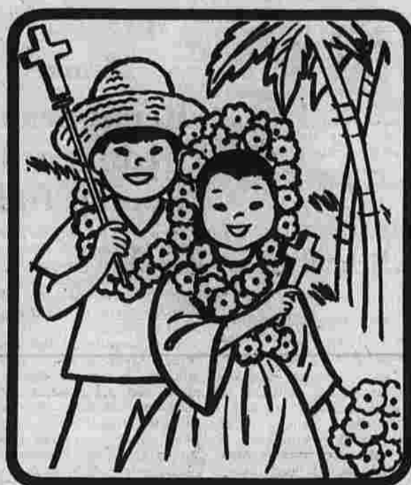
In the Philippine Islands, children celebrate Christmas with a colorful holiday parade!