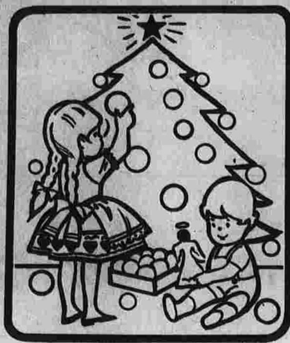
In Germany, little boys and girls decorate the "Tannenbaum" — their Christmas tree!