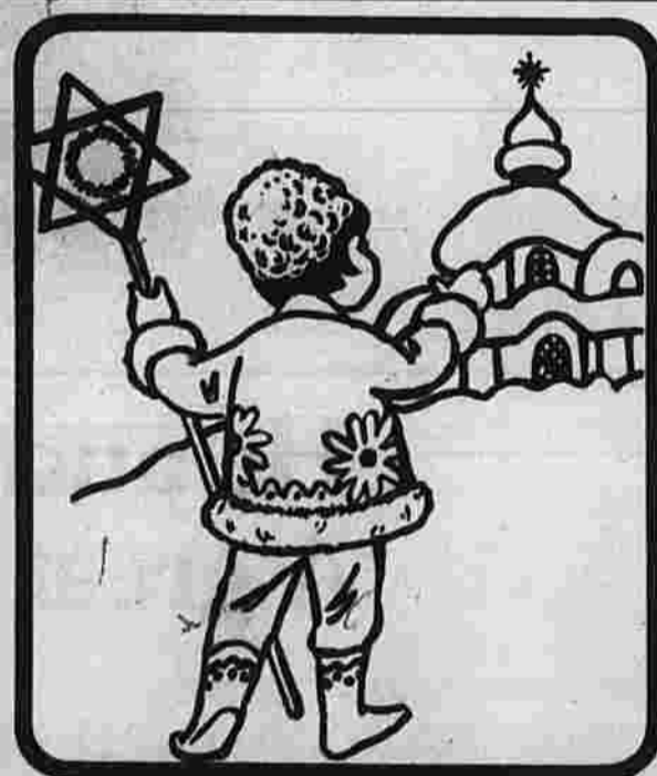
In Poland, the "Star Boys" go from home to home singing carols on Christmas Eve.