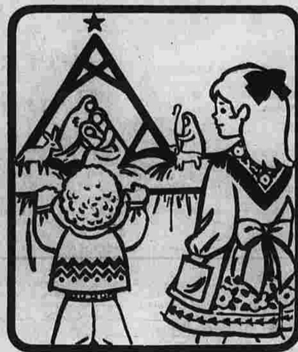
Every Italian home has its "Preccio", a miniature nativity scene, at Christmas time.