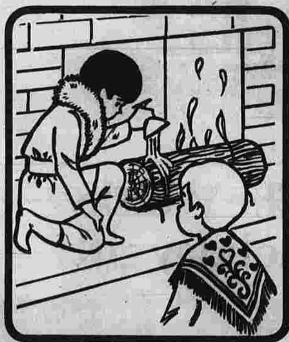
Yugoslavians pour wine on the "Badnyak", the yule log, as part of a holiday tradition.