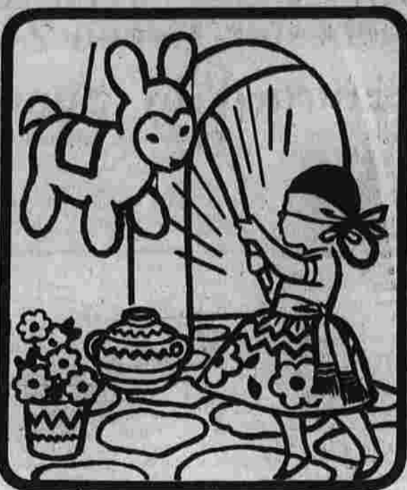
In Mexico, children break open a colorful clay "pinata" that is filled with lots of goodies.

1 ST PRIZE $15 2 ND PRIZE $10 3 RD PRIZE $5