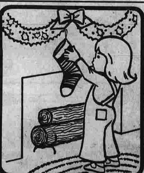
In the U.S.A., youngsters hang up stockings to be filled with gifts by jolly St. Nick!