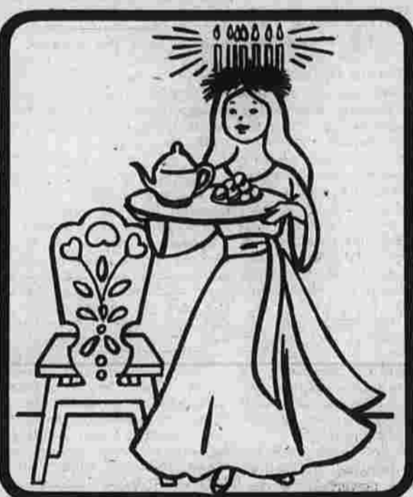
In Sweden, "St. Lucia" awakens the family with coffee and cakes to begin the holiday season.