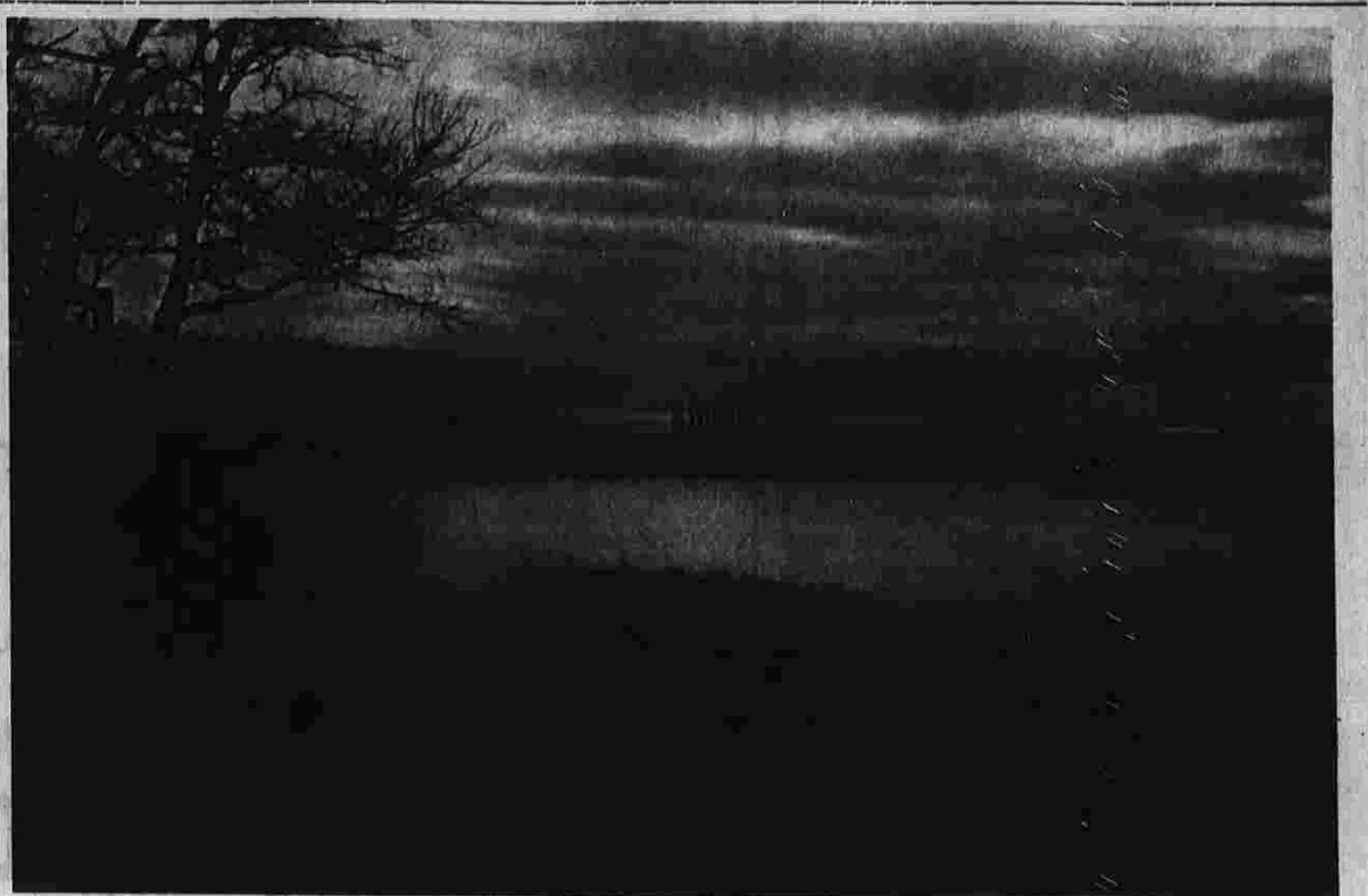
Familiar Early Morning Scene Today

Section 8-2 provides in part that zoning regulations "shall be designed to lessen congestion in the streets," the court pointed out. Though the appeal by the residents charged error on several grounds, the Supreme Court addressed itself only to the charge that changing the zone to business use would create a traffic hazard and aggravate existing hazards. "In the case before us," the court said in part, "it is clear that traffic congestion in the area affecting the subject property already existed and would be aggravated by the addition