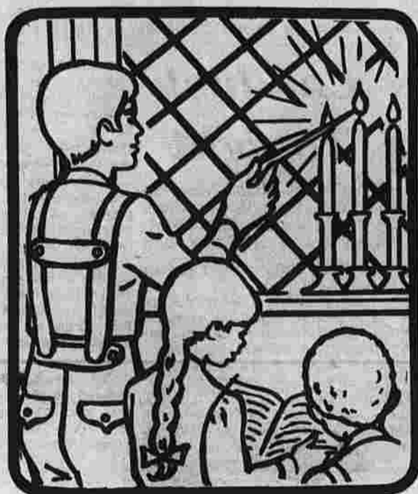
Austrian families light three large candles and sing hymns during the Christmas season.