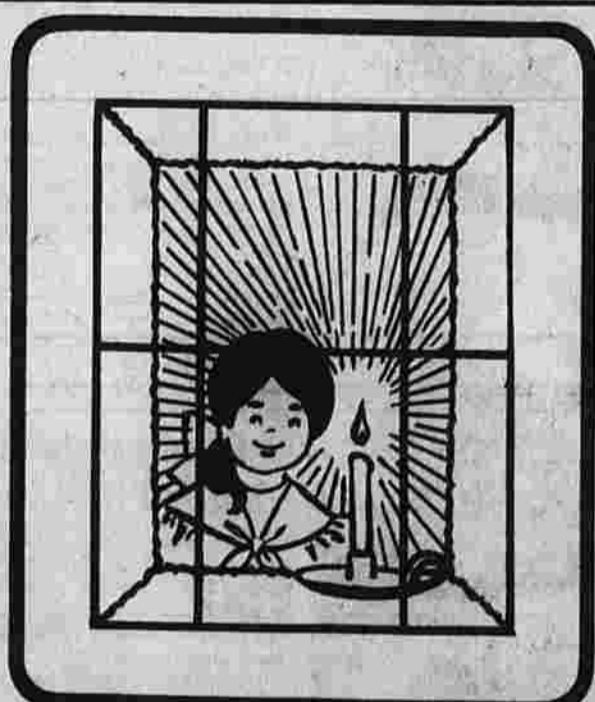
On Christmas evening, the Irish place lighted candles in windows to welcome the Holy Babe.